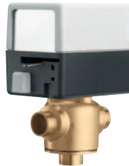
Z1 - ZONE VALVES