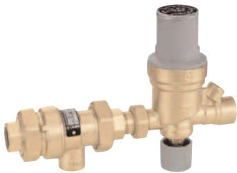
AUTOFILL / BACKFLOW