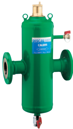
AIR - DIRT SEPARATORS